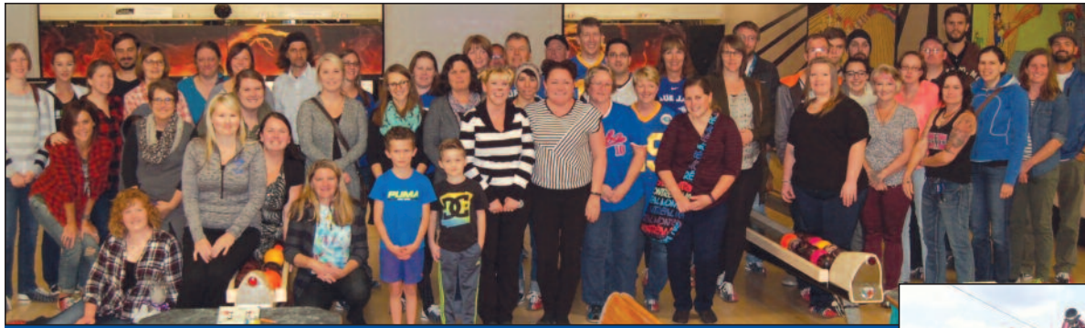
A salute to the Shakespeare Fire Department for donating B-B-Q proceeds to Teddy Bear & Friends!

Each donation is precious, and every donor is priceless ... individuals, groups, and organizations.